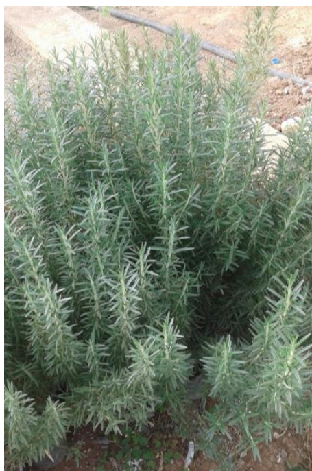
Figure 1. Mature plant of R. officinalis

essential oil constituents in the aerial parts of R. officinalis as a basic research for its application in the future.